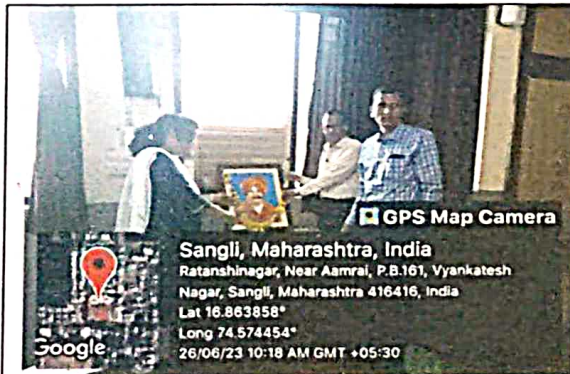
Celebration of 149 th Birth Anniversary of Chhatrapati Shahu Maharaj